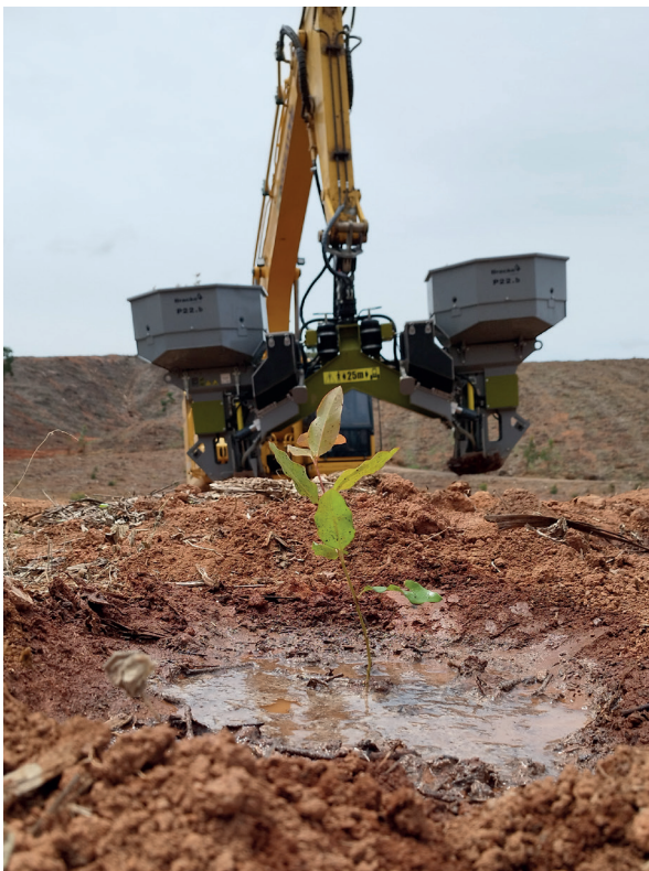
The Bracke P22.b has a low planting position to concentrate the irrigation water