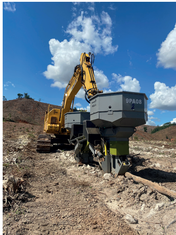
Bracke P22.b is mounted with a rotator and link that allows seedlings getting planted in a upright position